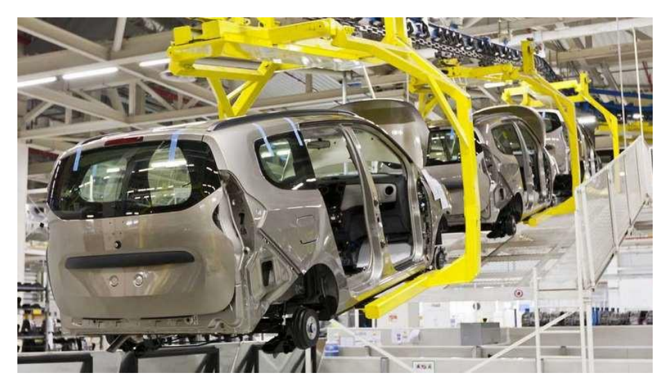
Figure 3: Beta Test on Assembly line section

technicians or mechanics. The systems are simply tools to help them in the pursuit of asset optimization, which with the ongoing skilled workforce shortage, the more tools the mechanics have in their toolboxes, the better off they will be.